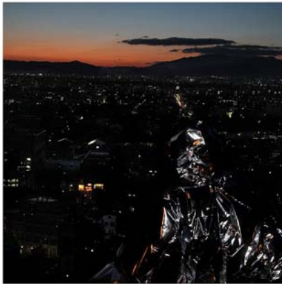
Sascha Weidner, Fragmente II , 2013, Pigmentprint, 70 cm x 70 cm